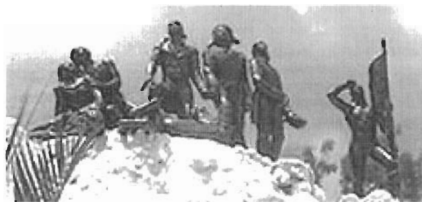
18 novembre 1804 Vertières, Cap-Haitian, HAITI

In October 2001, at its last General Assembly, UNESCO, has adopted the resolution to introduce at the United Nations that 2004 be declared: The International year for the struggle against slavery and its abolition.