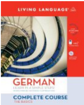
Complete German: The Basics (4 CDs + 2 books)